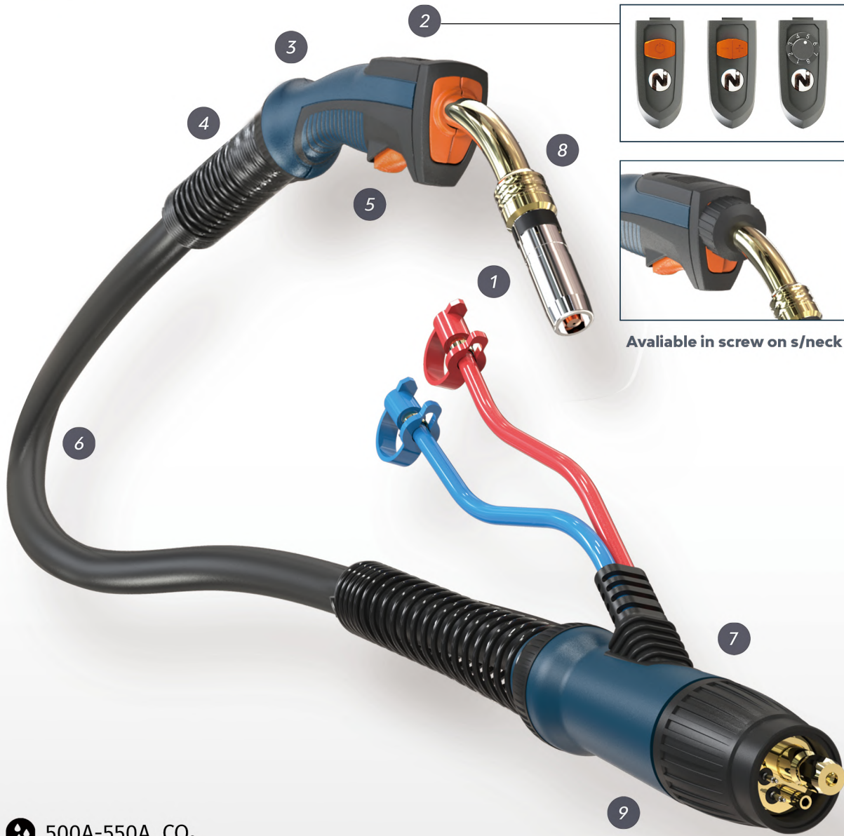
Available in screw on s/neck